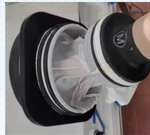
Direct-access Operation System